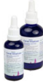
Korallen-Zucht Coral Vitalizer